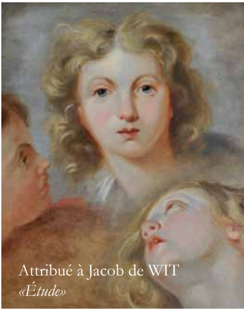
Attribué à Jacob de WIT «Étude»