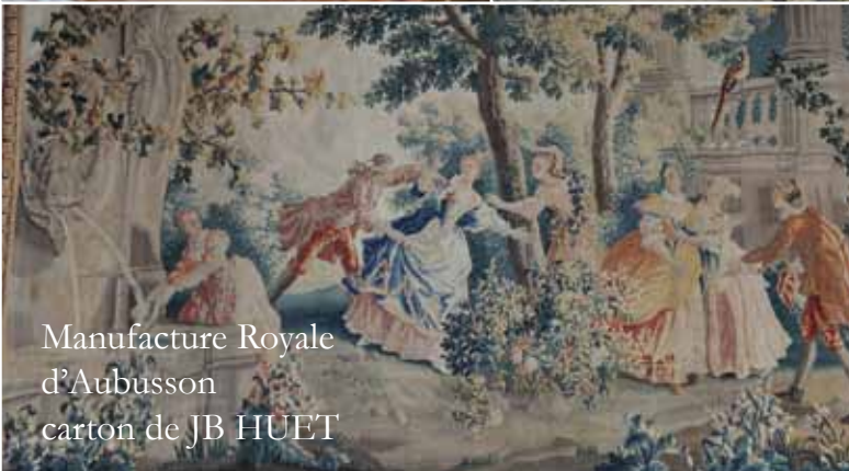
Manufacture Royale d'Aubusson carton de JB HUET