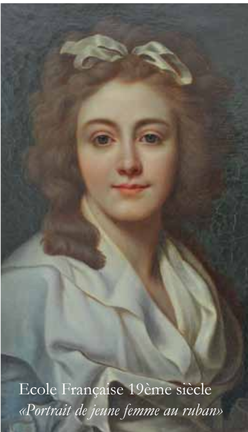
Ecole Française 19ème siècle «Portrait de jeune femme au ruban»