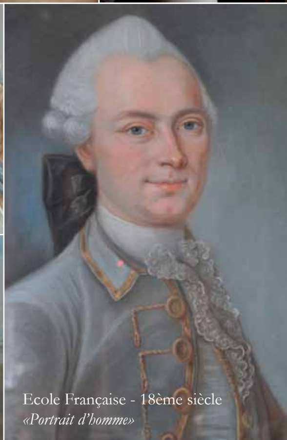
Ecole Française - 18ème siècle «Portrait d'homme»