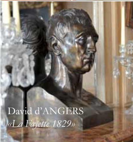
David d'ANGERS «La Fayette 1829»