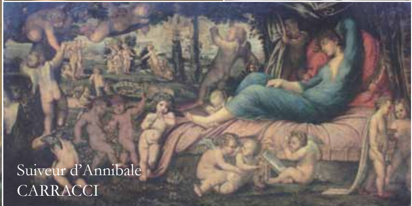
SUIVEUR D'ANNIBALE CARRACCI