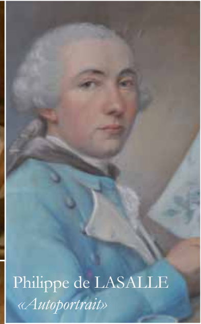
Philippe de LASALLE «Autoportrait»