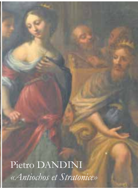
Pietro DANDINI «Antiochos et Stratonice»