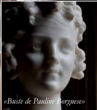
«Buste de Pauline Borguese»