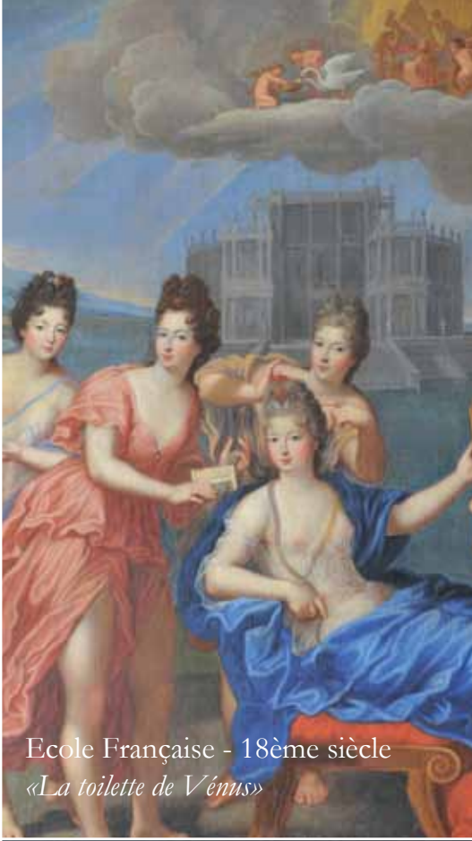
Ecole Française - 18ème siècle «La toilette de Vénus»