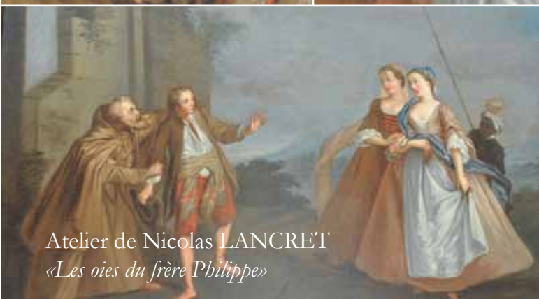
Atelier de Nicolas LANCRET «Les oies du frère Philippe»