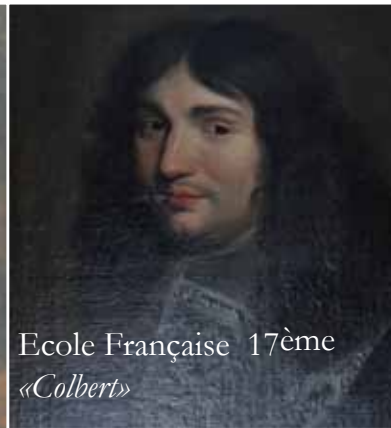
Ecole Française 17ème «Colbert»