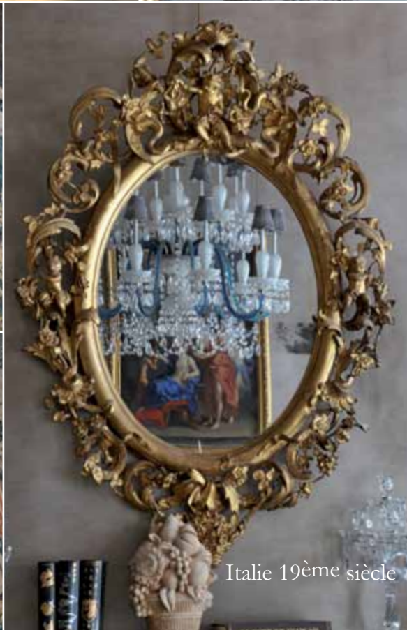
Italie 19ème siècle