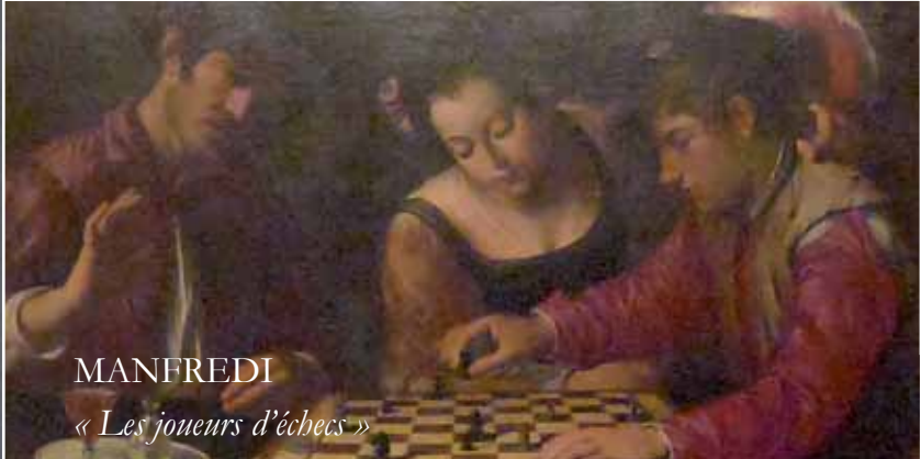
MANFREDI « Les joueurs d'échecs »